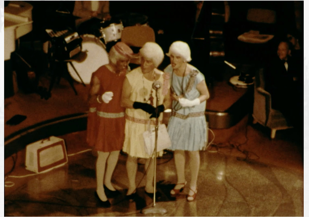
Zee van Ruimte